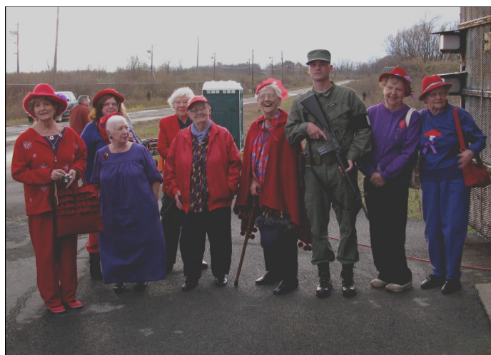
"Private Ryan" maintaining his composure with the Red Hat Ladies!

Their interest in everything we saw, and their willingness to ask tough questions was remarkable! I think I was able to answer all their questions with enough accuracy to satisfy them. We had a great time and really got into some of the critical issues associated with protecting the white deer at the depot. If I ever had any doubts about the Red Hat Ladies or the value of our tours, they disappeared that afternoon. No doubt, it was the best tour of the Fall for me!