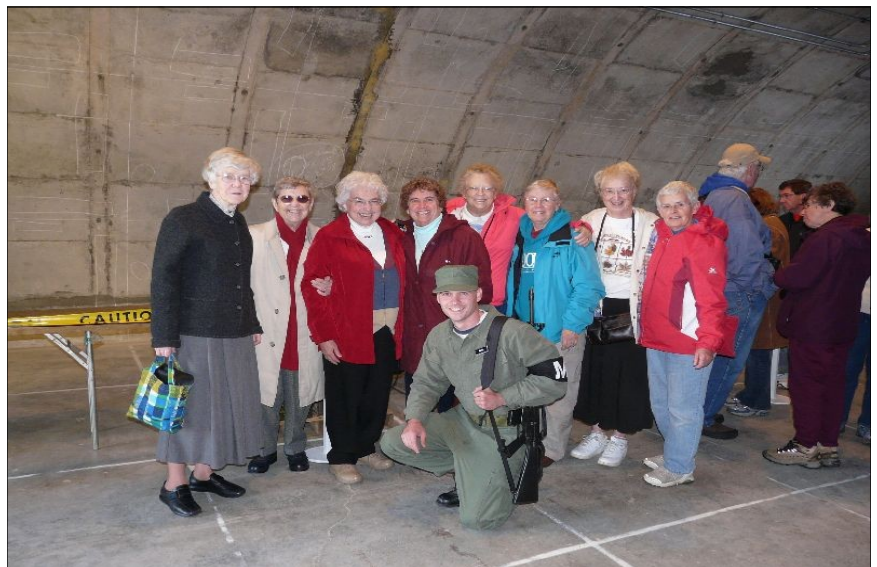
Private Ryan and happy tour goers inside Igloo #A0604 during the fall tours sponsored by Seneca White Deer, Inc.

Deer don't see color like humans do, rather they sense color as degrees of brightness so that a blaze orange jacket looks like a bright white object, hence the need for hunters to break up the solid block of orange with another color or design.