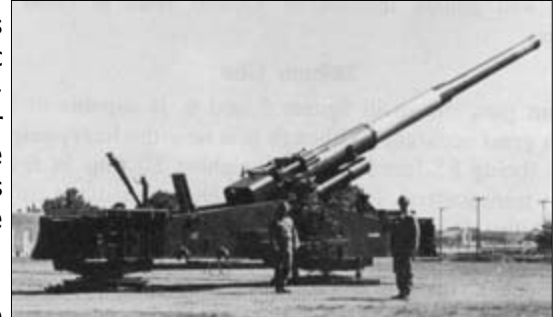
280mm "Atomic Annie" Nuclear Field Artillery in firing position

Gun crews could set the cannon up and be ready to fire in less than 15 minutes using hydraulic jacks and winches. The atomic cannon could be returned from firing position to traveling position also in 15 minutes, record time for any artillery of similar size. The huge gun is balanced on its nine foot circular base plate with jacks, enabling its crew (5 to 7 men) to move it through its full 360° traverse capability. The projectile and powder charge are loaded with the assistance of a power hydraulic ram.